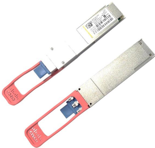
Figure 1. Cisco 40GBASE QSFP Modules

The Cisco® 40GBASE QSFP (Quad Small Form-Factor Pluggable) portfolio (shown in Figure 1; more details in Table 1) offers customers high-density and low-power 40 Gigabit Ethernet connectivity options for data center, high-performance computing networks, enterprise core, and distribution layers applications.